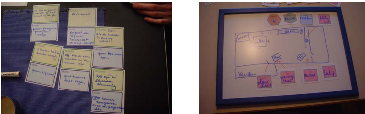
Figure 5: In the user study, users are asked to write down situated actions (1), and link these actions to a map of their living room (2)

The current focus is on how people build mental models of situations in the home. A qualitative approach is followed, based on the grounded theory [5]. Using the grounded theory approach, data can be systematically gathered and analyzed through the research process, resulting in a theory grounded in data. Data is collected using interviews and puzzle-like assignments (Figure 5), in quick iterations. The research begins with an area of study with no preconceived theory, and allows the theory to emerge from the data.