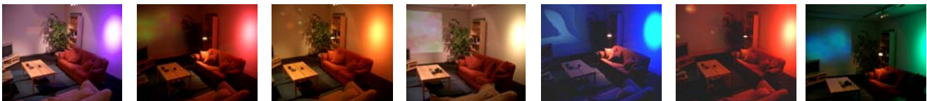
Figure 3: Pictures of atmospheres in StudioHome; the tool will be used to create a situated profiler

The tool will be used to create a situated profiler for the atmosphere controller in StudioHome, a living room lab where atmospheres can be dynamically created, part of ID-StudioLab.