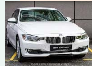
Figure 87 The two-part grille is BMW's visual signature