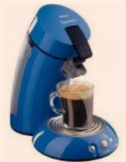
Figure 36 Senseo coffee maker