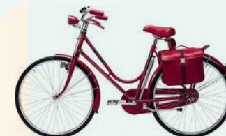
Figure 46 Picture of a bicycle