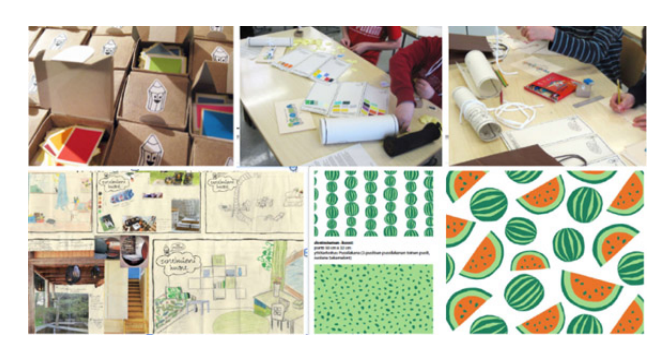
Figure 2. The upper row, co-designers instruments and co-design in action. The lower row, resulting design ideas on the left by the children and on the right by the designer.

The first case illustrates kids as co-designers. A textile designer wanted to involve school children into a process of creating textile prints for children. The objective was to gain an understanding of the kids' world, their preferences and to listen to their opinions in a creative process. The kids were first explained what textile design is about. Secondly, they were given a set of hand made probing tasks that included questions for telling about their lives, hobbies and such, colour samples for selecting the favourite colours, drawing tasks for telling about their homes, their dream rooms and creating textile patterns. The designer then analysed the probing materials, made interpretations of the colours, the lifestyles and pattern preferences and collected them into mood boards and inspired by the results designed a set of patterns. Finally, the designs were evaluated by the same children. (Mitrunen 2010)