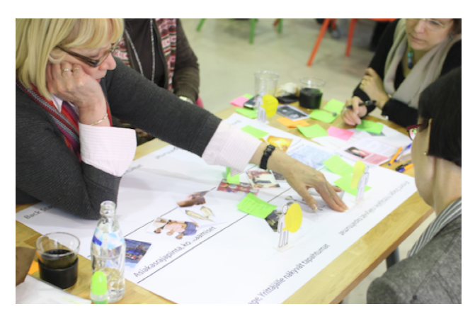
Figure 4. Design games as the platform for collaborative reflection

The fourth case is about facilitating a process in which the aim was to streamline customer services. Three co-design workshops were organized with the aim of gathering people from a complex network of stakeholders together to discuss, plan and envision future service systems. The participants included people from a public organisation and its partners. The case is an example of a trend in which public organisations and individual service providers are learning customer-oriented service business. The transformation process requires facilitation in the learning of new attitudes and helping out of the box thinking in organizations. (Hakio & Mattelmäki 2011)