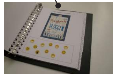
Het aanbevelingsboek, a folder which contains the previous books that have been presented.