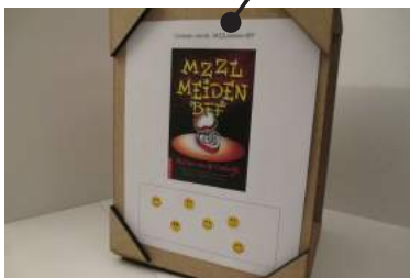
Recommendation side, where the recommendations are placed and shown.