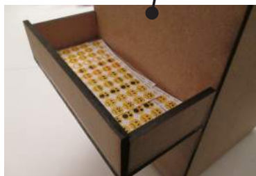
Holder for the sticker sheets.