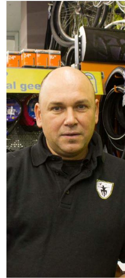
1 Bike Store