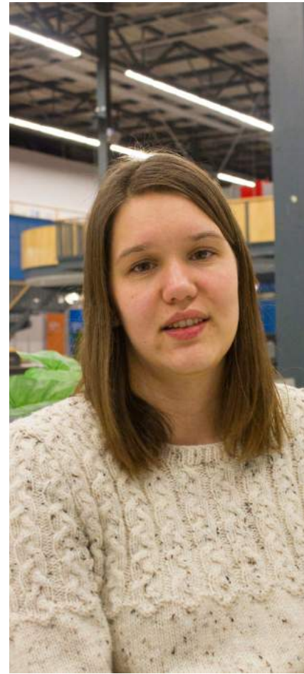
1 Dutch Cyclist