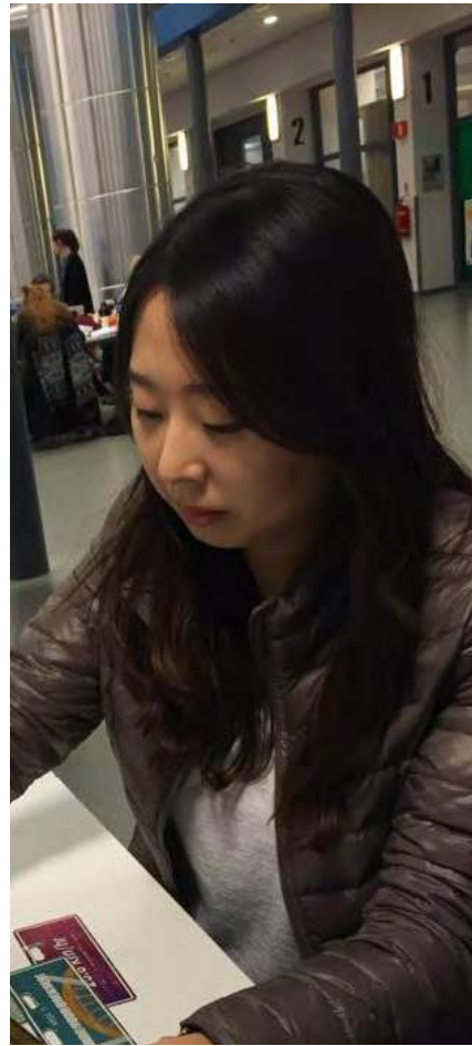
1 New Cyclist