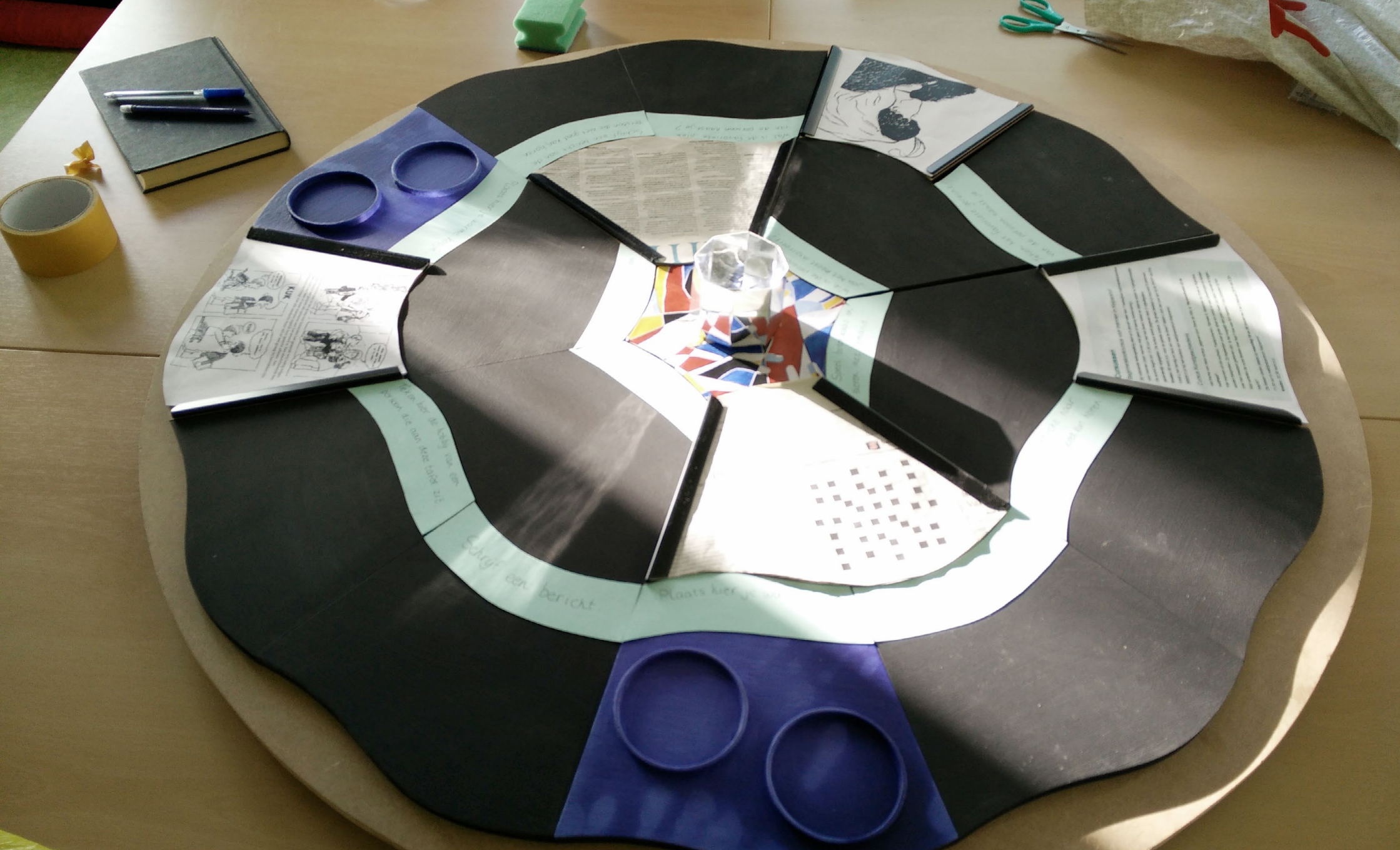
The Communication Board Common area in senior home