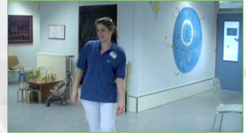
The dentist picks up the patient.