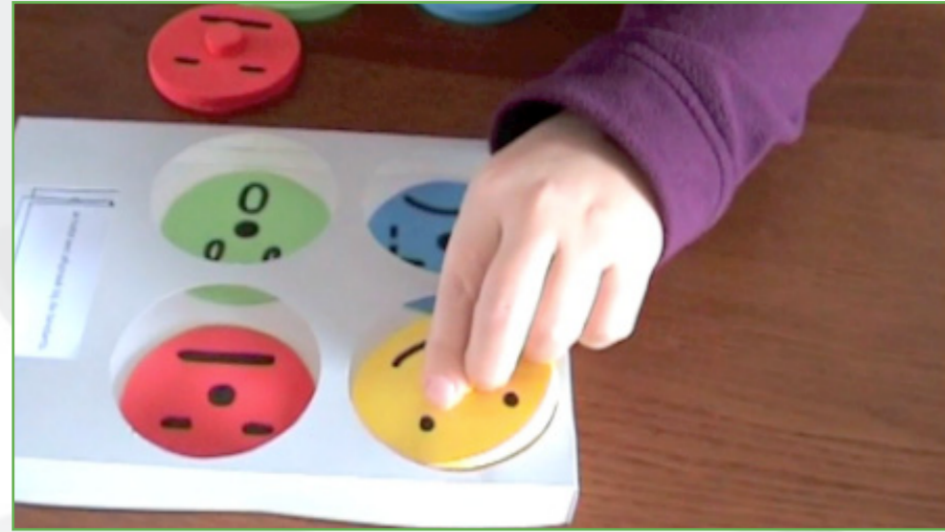
With the emoticons feelings can be expressed.