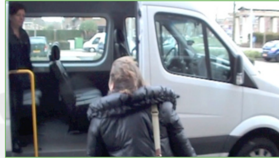
It's time to go to the dentist.