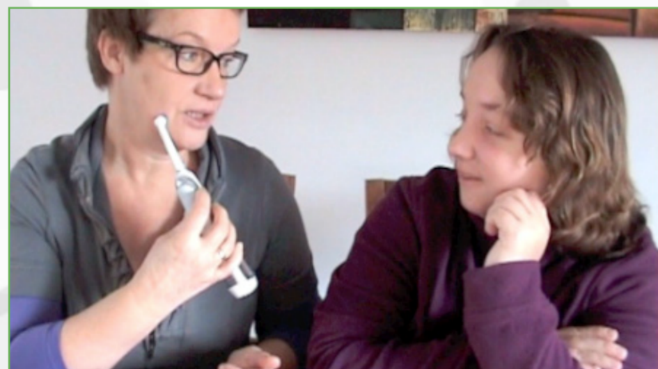
Now the learning process can begin. How to brush your teeth at home?