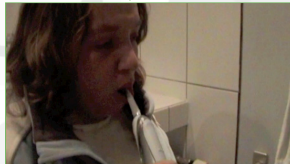
Time to brush your teeth as taught!