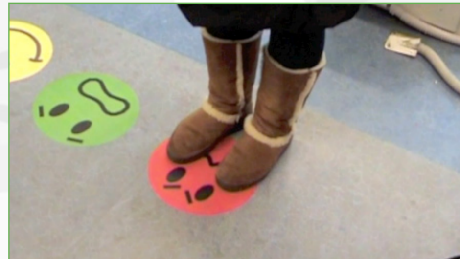
After the explanation the dentist refers to the emoticons from Pick-it-up!.