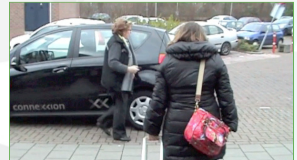
It's time to go home.