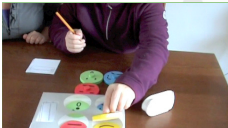
Talking about the dentist visit. The emoticons help transferring context.