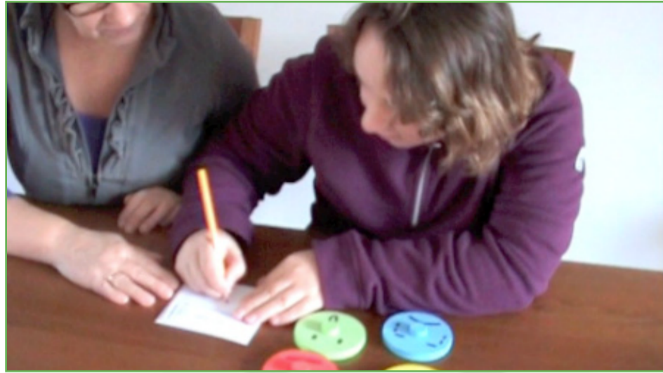
At home the cards help explaining the dentist visit. Drawing helps understanding.