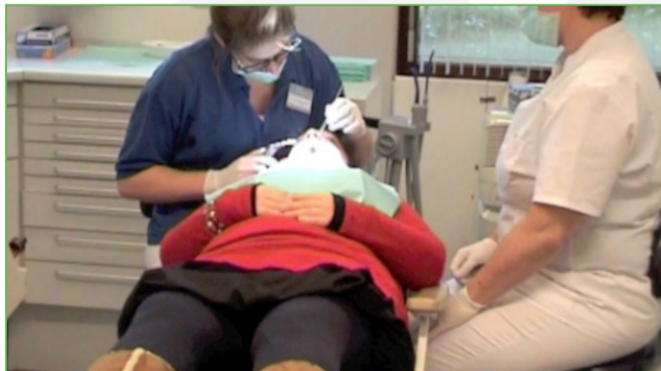
Time for the treatment.