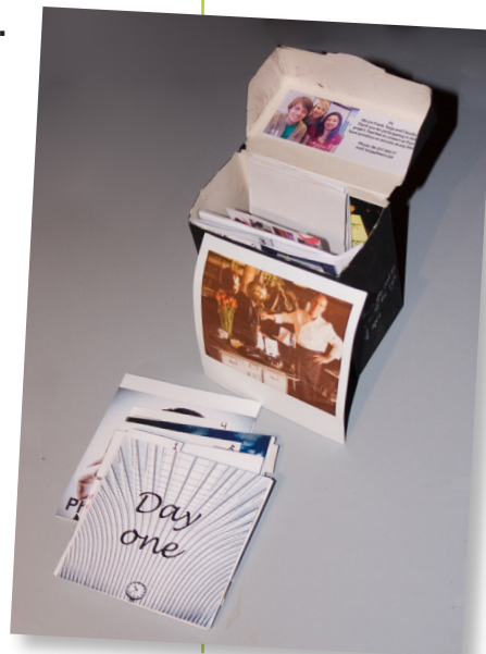
The sensitizing box containing various assignments on the subject

We found it important to make the sensitizing packages fun and exciting to do. Therefore, we made a sensitizing box, painted with blackboard paint and written with white pencil. In this box we put the assignments cards, one for each day. The thought behind this, is that they would have a new surprise each day, like unwrapping a present. We also put stickers and a photo assignment in the box. A special white pencil was added to fill out the last assignment, put outside the box, saying: " the ingredients for my ideal business "