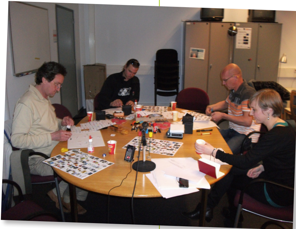
Impression of the session

"I'm a cook, 52 years old. I've been cooking for about 35 years and it's still my hobby. Cooking. But running a restaurant is quite a job. Because of all rules and personnel, plus all different kinds of problems you could do without."