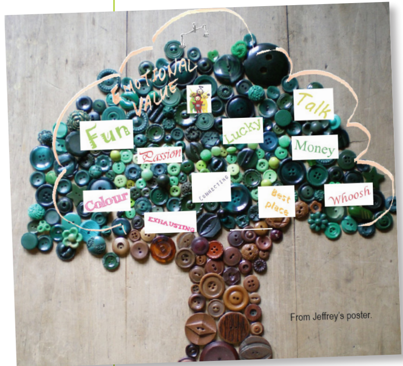
Collage created by a participant

The analysis of the data and clustering the insights and information revealed many interesting insights. The data we gathered through the session gained much more value, combining inspiration and information.